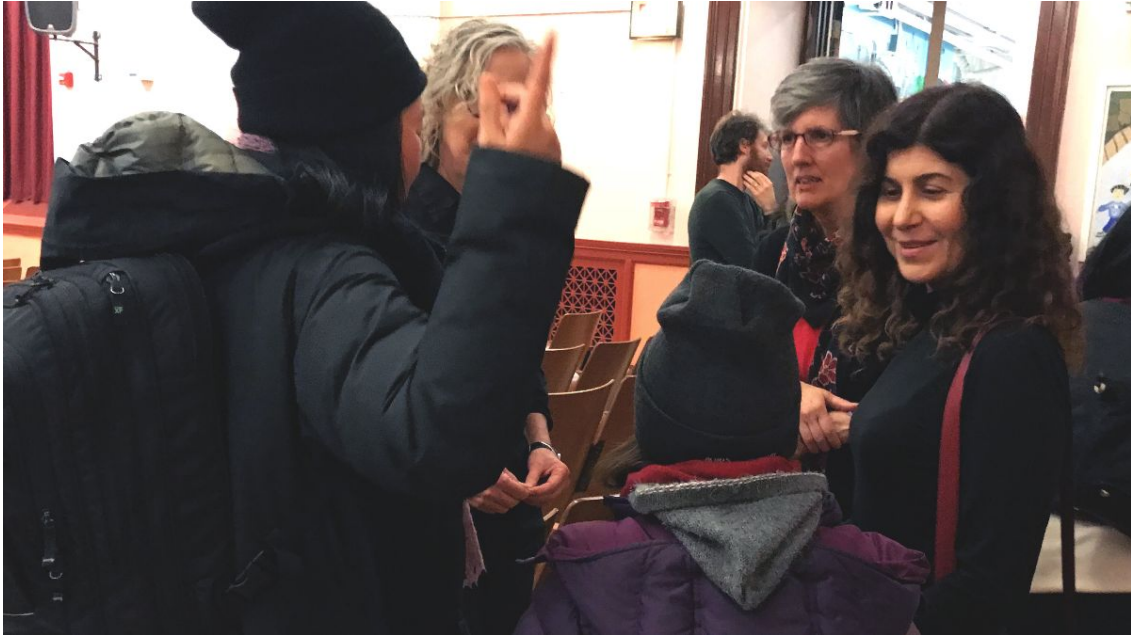
3/6/19 East Village Community School NY, NY Filmmakers chat with students and parents before screening.

In honor of Public Schools Week, we're offering a major discount on all Backpack screenings. Contact us now through April 1st to learn more! Just respond to this email, or connect via our website with the phrase "PUBLIC SCHOOLS WEEK"!